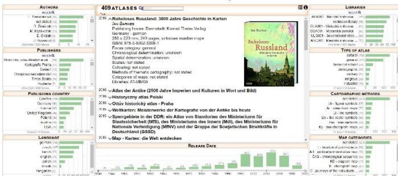
Figure 2. The basic layout of the web application in Firefox